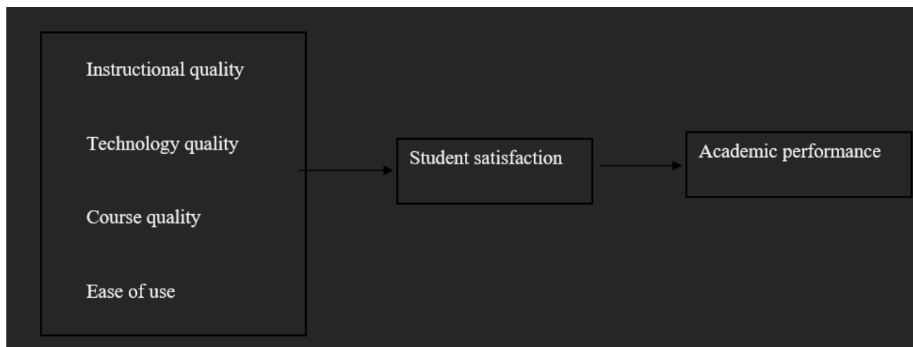
Figure 1: Conceptual framework of the study

2: Investigate the relationship between student satisfaction with the LMS and academic performance.